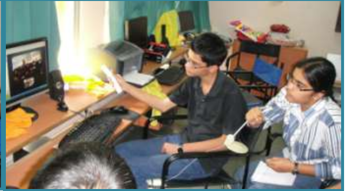
Skype Debate with Neston High School, UK