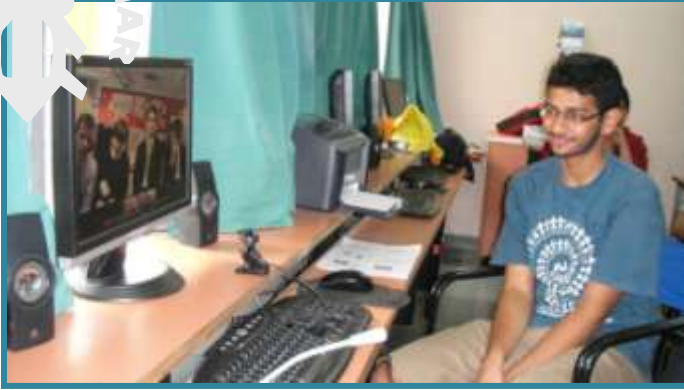
Skype debate with Mossland School, UK